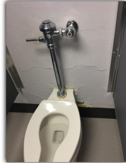
Water damage from roof leaks on an internal wall. Only resolution is to fix the roof and completely replace wall.