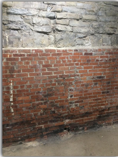
Main load-bearing wall, in basement, with brick and mortar rotting out due to water damage.