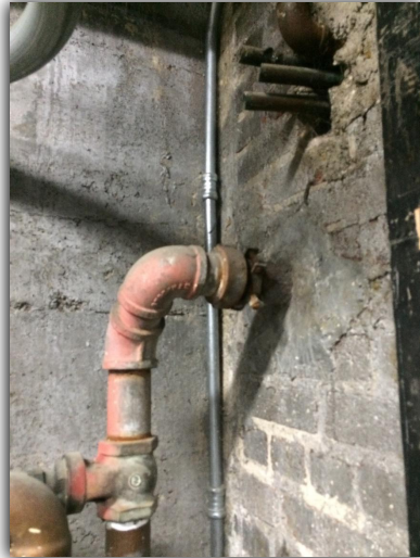
Remaining original pipe is iron which rusts and corrodes. In most cases it has already rusted and/or corroded.